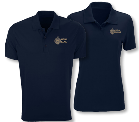
USNA MOM & DAD POLO | $42.00