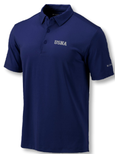
NAVY DRIVE POLO | $52.00