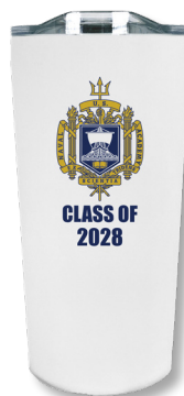
CLASS OF 2028 TUMBLER | $20.00