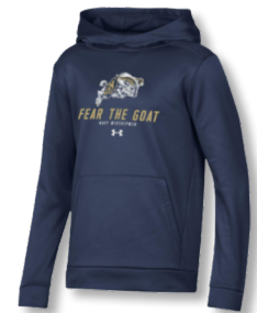
FEAR THE GOAT YOUTH FLEECE HOODED SWEATSHIRT | $52.00