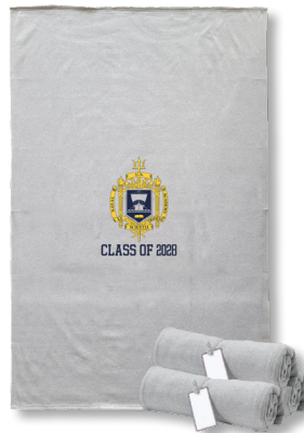
CLASS OF 2028 BLANKET | $39.00