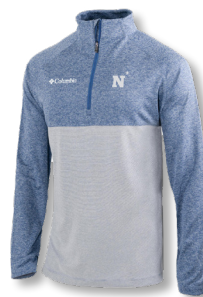
N* OMNI-WICK ROCKIN' IT 1/4 ZIP | $82.00