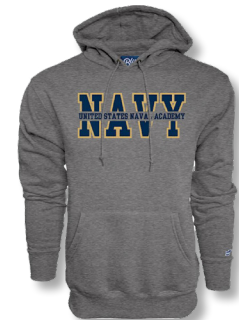
USNA NAVY HOODIE | $65.00