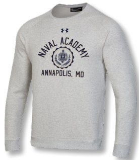
MEN'S UA COTTON CREW | $59.00