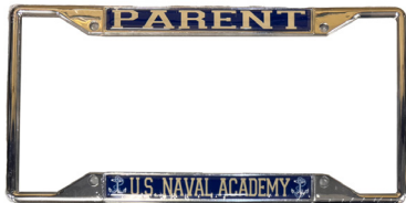
USNA PARENT LICENSE PLATE | $20.00