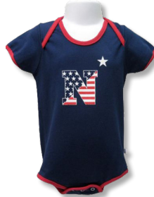
N* FLAG ONESIE | $29.00