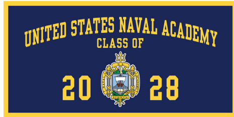
CLASS OF 2028 BANNER | $36.00