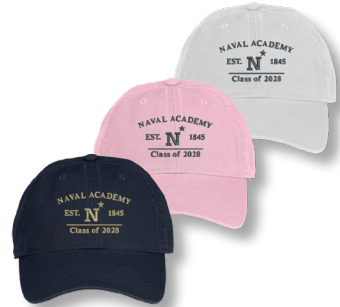
CLASS OF 2028 ADJUSTABLE CAP | $20.00