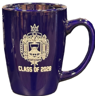
CLASS OF 2028 MUG | $10.00