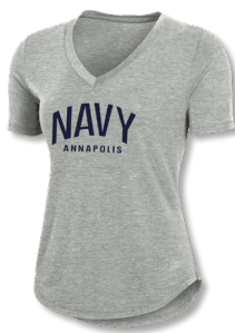
V-NECK WOMEN'S NAVY TEE | $40.00