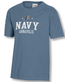
NAVY GOAT/ BEAT ARMY YOUTH TEE | $22.00