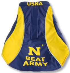
BAYDOG SAGINAW FLEECE DOG JACKET | $50.00