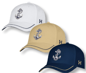
ANCHOR/NAVY ADJUSTABLE HAT | $39.00