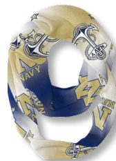
OMBRE INFINITY SCARF | $16.00