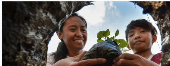
Coalitions in the context of the Food Systems Summit