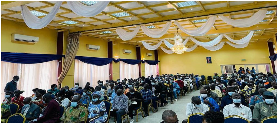
Community dialogue on UHPR, Dec 2021