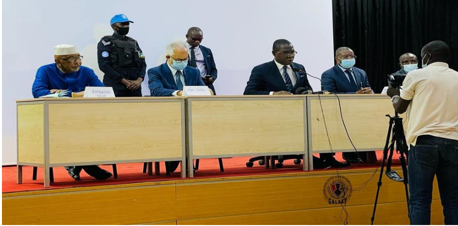
Opening of UHPR review with PM and ADG , Dec 2021