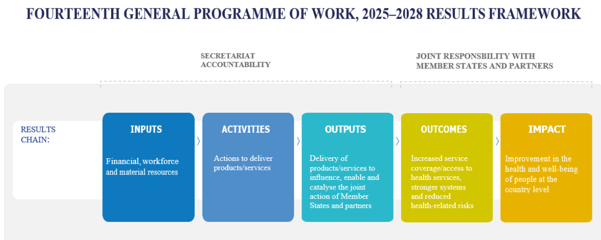
Fig. 1. WHO results framework