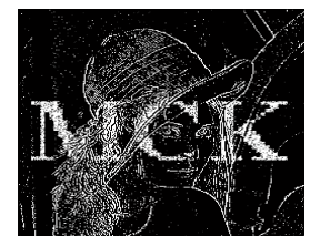
Figure 4.4: Low Pass Filter (3, 3)