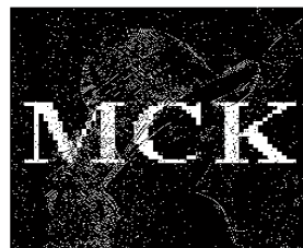
Figure 4.2: Gamma Correction ( [0;0.8],[0;1] )