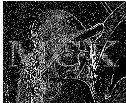
Figure 4.7: High Pass Filter [0.6]