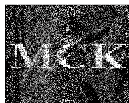
Figure 4.3: Histogram Equalization