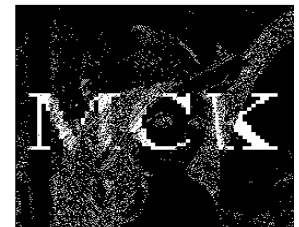
Figure 4.1: Intensity Adjustment (1.5)