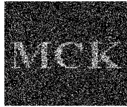
Figure 4.6: Gaussian Noise (mean=0, variance 0.001)