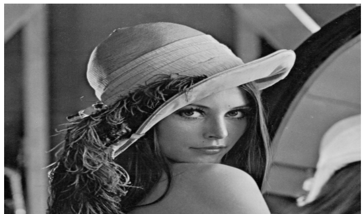
Figure 2: Original Image