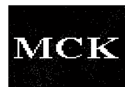
Figure 3.2: HH (SR 0.9181)