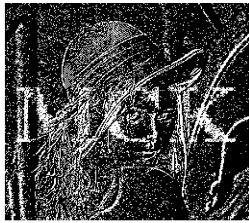
Figure 4.5: Resizing (512,256,512)