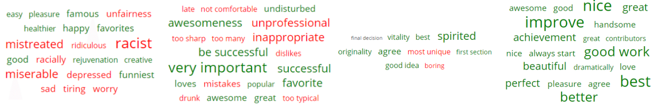
Figure 2. Word clouds of team discussions. From left to right: Crashing Competitive, Crashing Collaborative, Matching Competitive and Matching Collaborative. Word/concept frequency indicated by word size. Positive sentiments in green, negative sentiments in red, neutral in black.

same outcome can be potentially beneficial for other applications, where group tasks among previously unknown individuals can take place, such as learning applications or corporate settings.