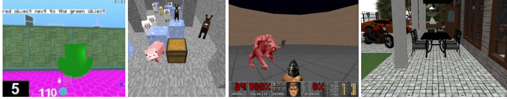
Figure 2: 3D environments (Left to right): DeepMind Lab, Malmö, VizDoom, HoME. Other environments focus on algorithmic challenges; HoME adds a full context in which to learn concepts.