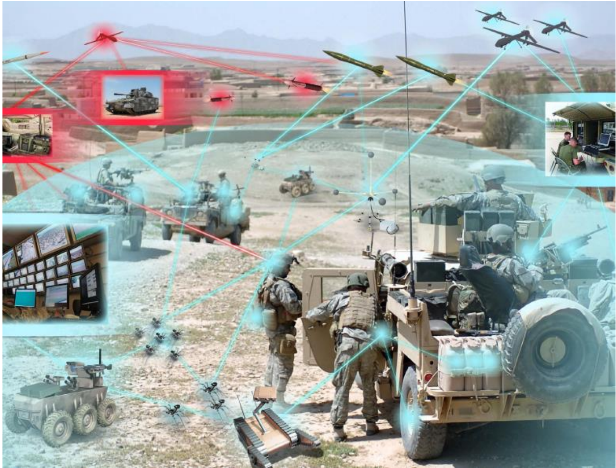
Figure 1 Broad variety of systems and other "things" will communicate and collaborate on the battlefield. (Source: Illustration by Evan Jensen, U.S. Army Research Laboratory)

To become a reality, however, this bold vision will have to overcome a number of major challenges. As one example of such a challenge, the communications among things will have to be flexible and adaptive to rapidly changing situations and military missions. This will involve organizing and managing large number of dynamic assets (devices and channels) to achieve changing objectives with multiple complex tradeoffs. Such adaptation, management and re-organization of the networks must be accomplished almost entirely autonomously, in order to avoid imposing additional burdens on the human warfighters, and without much reliance on support and maintenance services. How can this be done?