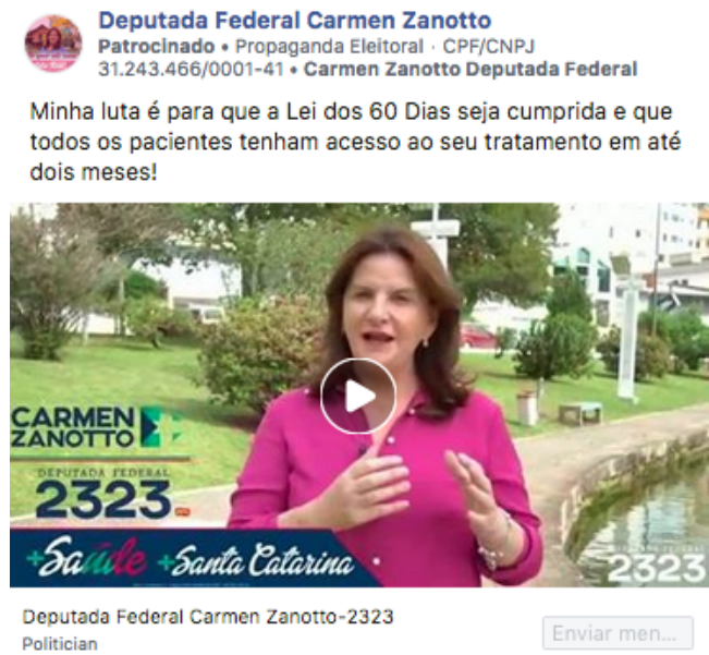
Figure 1: Example of an official political ad posted during the election period in Brazil.

We implemented several machine learning-based techniques for detecting political ads on Facebook. We tested supervised classifiers such as Naive Bayes, Random Forest, Logistic Regression, SVM and Gradient Boosting as well as a recently proposed Convolution Neural Network (CNN) built to detect political tweets. To evaluate our algorithms we created a golden standard test collection with