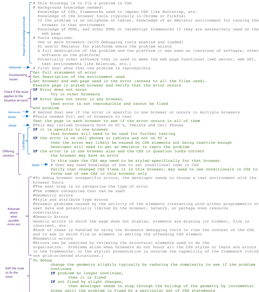
(b) An authored strategy that covers multiple exceptional conditions and edge cases.