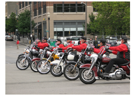
(b) Eight men on motorcycles.