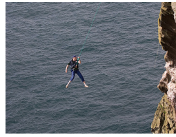
(a) A person rappelling a cliff.

lation. \text{wait-}k columns show how many entities were correctly translated by \text{wait-}k SNMT and MSNMT models from # total entities for each k scenario. Columns Full show upper-bounds of how many entities can be correctly translated if the models were trained with full sentences for entities from each k . Comparing Full results to \text{wait-}k for both SNMT and MSNMT shows that it is hard to correctly translate entities when k is small. Furthermore, comparing \text{wait-}k results of SNMT to MSNMT, it can be seen that the smaller value of k , the better MSNMT can handle different source-target word order than SNMT.