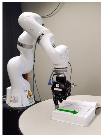
Figure 1: Robotic setup used in the experiments

In the present work, we consider the general problem of sliding an unknown object from an initial configuration to a target one while tracking a predefined path. We adopt the recent differentiable physics engine proposed in de Avila Belbute-Peres and Kolter (2017), and extend it to take into account frictional forces between pushed objects and their support surface. To account for non-uniform surface properties and mass distributions, the object is modeled as a large number of small objects that may have different material properties and that are attached to each other with fixed rigid joints. A simulation error function is given as the distance between the centers of the objects in simulated trajectories and the true ones. The gradient of the simulation error is then used to steer the search for the mass and friction coefficients.