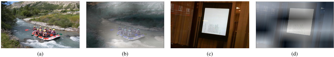
Figure 3: (a) & (c) Two images in the dataset whose annotated affective dimensions are very interesting & very less interesting respectively. The proposed model predicted all the affective dimensions with near precision for these two images. (b) & (d) Primary attention weights when the images are in the validation split during cross-validation. Darker parts signify less attention weights whereas lighter parts signify more attention weights. In (b), the interestingness is driven by the more attention weights in the areas of the river, mountain & the people rafting and less weights in the area of shrubs. In (d), the very less interestingness is driven by more or less random weights all over the screen.

This particular choice of architecture ( primary attention over the sub-images & secondary attention over the pre-trained models) in the proposed model is inspired by our hypothesis that prediction of the all the different affective dimensions will be more or less affected by the same areas of the image. The primary attention module essentially learns to find the sub-parts of the image which will be more important for the prediction of the affective dimensions. Rather than same primary attention parameters ( V(p) , W(p) & b(p) ) for all the pre-trained models, one might hypothesize that separate primary attention parameters (one set of V(p) , W(p) & b(p) for each pre-trained model) would be more appropriate. This may seem a more flexible model in terms of attention computation, but we didn't find any considerable advantage of using this model in practice, in fact the performance decreased in many cases. Introduction of