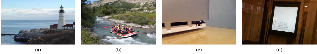
Figure 1: Four example images from the dataset. (a) & (b) has been annotated as very interesting whereas (c) & (d) has been annotated as very less interesting.

to boost the backward information flow during back-propagation. The Resnet model achieved state-of-the-art performances in ILSVRC & COCO 2015 competitions. We use the pre-trained Resnet model as a feature extractor to extract 2048 dimensional feature vectors for each of the sub-images.