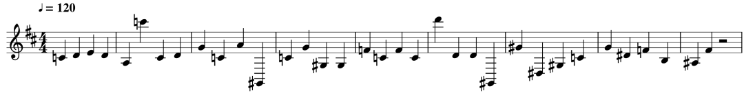
Figure 2.: Step 20 loss 3.74101

10 iterations later, with 3.19 of loss (fig 3), it is easy to notice the apparition of some basic patterns. There are basically 3 motifs, one in bars 2-3, one in bars 4-7 and one in bars 8-9. They are relatively consistent internally, with some exceptions like the last A in bar 5 which is still evidence of randomness. Also, the 3 motifs are disconnected between them, with interval jumps too big for a melody.