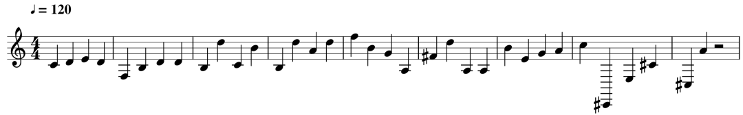
Figure 3.: Step 30 loss 3.19856

10 iterations later, with 3.19 of loss (fig 3), it is easy to notice the apparition of some basic patterns. There are basically 3 motifs, one in bars 2-3, one in bars 4-7 and one in bars 8-9. They are relatively consistent internally, with some exceptions like the last A in bar 5 which is still evidence of randomness. Also, the 3 motifs are disconnected between them, with interval jumps too big for a melody.