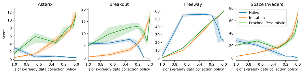
Figure 2: Performance of deep FDPO algorithms on a dataset of 500000 transitions, as the data collection policy is interpolated from near-optimal to random.

composition, we showed the core issue with naïve approaches, and introduced the pessimism principle as the defining characteristic of solutions. We described two families of pessimistic algorithms, uncertainty-aware and proximal. We see theoretically that both of these approaches have advantages over the naïve approach, and observed these advantages empirically. Comparing these two families of pessimistic algorithms, we see both theoretically and empirically that uncertainty-aware algorithms are strictly better than proximal algorithms, and that proximal algorithms may not yield the optimal policy, even with infinite data.