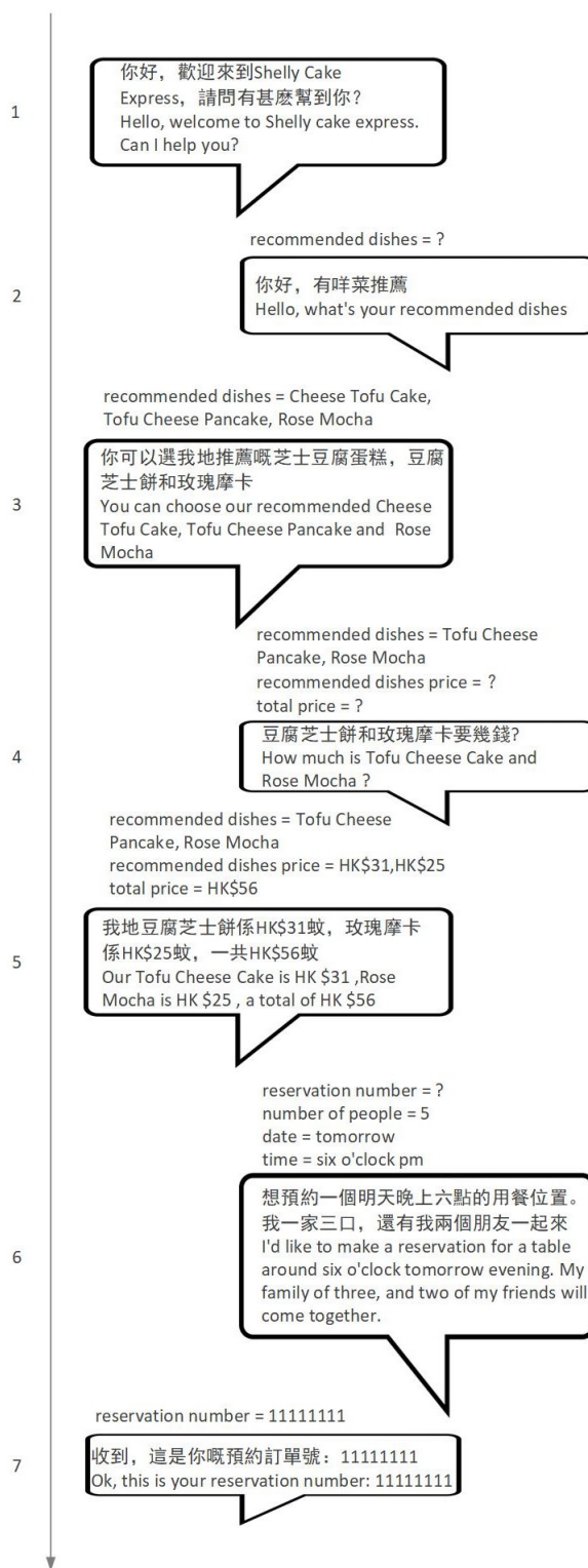
Figure 1: A few turns of a dialogue in KddRES.