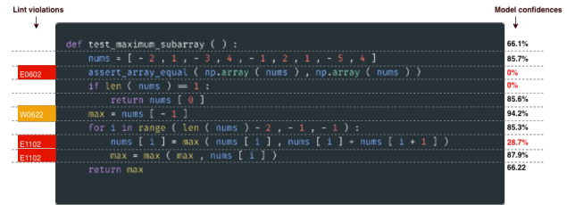
Figure 2. A code snippet translated from Java to Python3 with the corresponding Pylint errors and model confidences for each line. The max variable is used by the TransCoder output both as a variable and as the maximum operator. As we frequently found, little correlation is visible between model confidences (right) and lint violations (left). See Appendix A.3 for the Java source code, and Figure 5 in the Appendix for an enlarged image.

Another key insight that emerged from our user study was the need for interpretable model confidence values (see Section 2.1.2), to better help users focus on syntactical or conventional issues. To study the correlation between model confidences and lint violations through Pylint, we compute PBCC values for the two uncertainty metrics defined in Equations 1 and 2. Table 1 summarizes these results for the most commonly observed lint violations. We observe no correlation between model confidence: p(y_t|y_{<t}, x, \theta) , and tokens which resulted in lint violations. This miscalibration between model confidence and model interpretability has been studied in Guo et al. (2017), and was also pointed out by multiple users in our user study. In this work, we utilize only the decoder output probabilities to identify low confidence tokens, while Fomicheva et al. (2020) propose multiple metrics utilizing decoder output probabilities and attention weights for unsupervised quality estimation. Additionally, Guo et al. (2017) propose a calibration scheme to produce calibrated probabilities from deep neural networks. Our results underline the need for further work on metrics that better align with human perception of code translation.