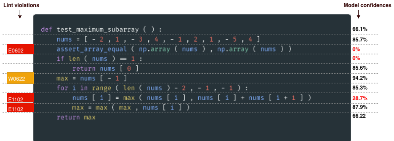
Figure 5. A code snippet translated from Java to Python3 with the corresponding Pylint errors and model confidences for each line. The max variable is used by the TransCoder output both as a variable and as the maximum operator. As we frequently found, little correlation is visible between model confidences (right) and lint violations (left). See Appendix A.3 for the Java source code.