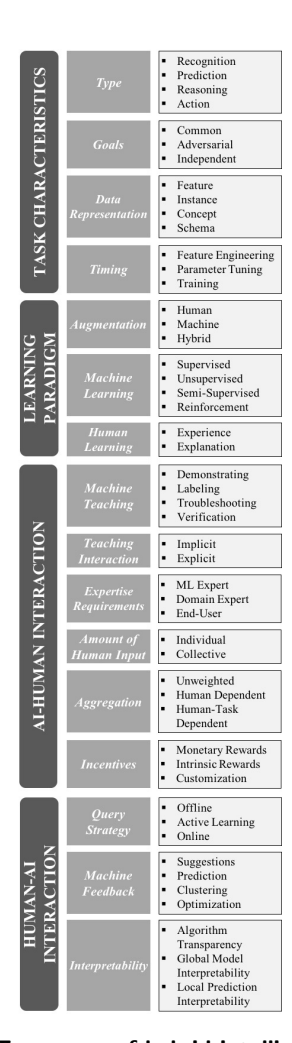
Figure 3. Taxonomy of hybrid intelligence design.

Timing in Machine Learning Pipeline: The last sub-dimension describes the timing in the machine