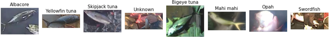
Figure 2. The 8 most common L1 fish species in Fishnet. Examples selected at random and cropped by bounding box.

the Fishnet Open Images Database, a large dataset for detection and fine-grained visual categorization of fish species onboard commercial fishing vessels. The current release of the dataset (version 0.3) consists of 406,463 bounding boxes in 86,029 images sourced from 73 different electronic monitoring cameras, making it the largest and most diverse public dataset of fisheries electronic monitoring imagery to date. Version 0.3 is limited to imagery from a single fishery in a relatively large geography (longline tuna in the western and central Pacific Ocean), however the challenges in this fishery are emblematic of many other large-scale industrial fishing operations around the world.