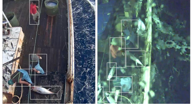
Figure 1. Two example images from the Fishnet dataset, captured by EM cameras mounted above the deck on longline tuna vessels. (Left) Ideal conditions: good lighting, high visibility, and no occlusion. (Right) Challenging conditions: low visibility due to harsh weather, water on the lens, artificial lighting, and hectic crew activity which occludes the fish.

More than a thousand commercial fishing boats carry electronic monitoring (EM) systems, which use onboard cameras to track fishing activity and provide accountability in the global seafood market. These systems produce large volumes of video data that are screened by trained human reviewers. Over the next ten years, the number of boats carrying electronic monitoring systems is expected to grow by 10-20x, outpacing current review capacity [26]. Computer vision has the potential to drastically reduce the time required to analyze this video by automatically detecting and classifying fish. However, the lack of publicly available data in this domain, and the systemic barriers to obtaining