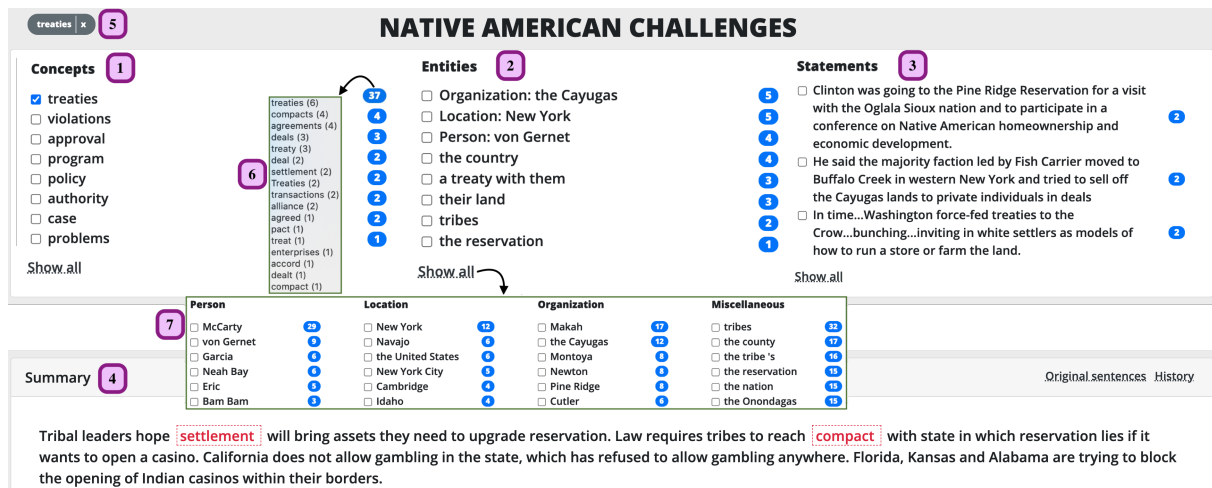
Figure 1: Our iFACETSUM web application over a set of 25 documents about “Native American Challenges”. The user gets an overview of the topic as Concepts [1], Entities [2] and Statements [3] facets. The facets are updated in response to the user’s choice of the facet-value “treaties” [5]. An abstractive summary is generated for the set of sentences corresponding to the “treaties” semantic cluster [4]. The mentions of a facet-value appear when hovering over its frequency [6]. Clicking “Show all” opens a pop-up with more facet-values. The Entities pop-up is categorized into further facets of Person , Location , Organization and Miscellaneous [7].

2020), yielding clusters of facet-value mentions (§3). Accordingly, summaries are generated based on the sentences that contain mentions of all selected facet-values.