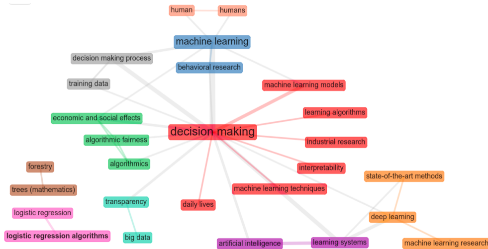
Figure 2: Keyword co-occurrence network

"... minimize the risk of erroneous or biased decisions in critical areas such as education and training, employment, important services, law enforcement, and the judiciary."