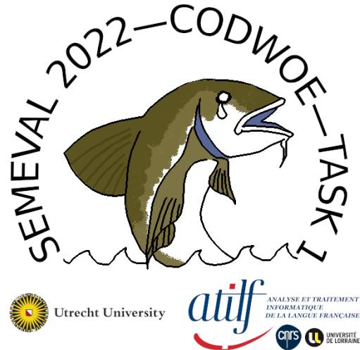
Figure 1: Logo for CODWOE shared task

of modern neural network architectures. This avenue of research, known as definition modeling, was pioneered by Noraset et al. (2017). One may however question whether the task is at all feasible: there is no guarantee that the information content of a dictionary definition is similar to that which is described by real-valued vectors inferred from word distributions.