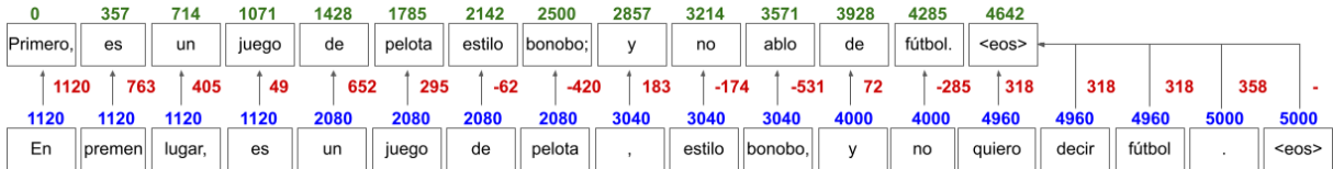
Figure 1: Example of AL computation between the oracle delays (in green) and the system delays (in blue). The lagging values (in red) are computed as the difference between the system and the oracle delays (the mapping is represented by an arrow). The 198ms AL is obtained by dividing the sum of the lagging (3379ms) by its count (17).

in time, the lower the final AL score will be). Second, why was this problem overlooked when AL was introduced? To answer this question, recall that AL for SimulST was initially proposed to evaluate systems showing a biased behaviour toward under-generation, with predictions length reaching at most the reference length. Indeed, earlier SimulST systems (Ma et al., 2020b) were designed to emit only one word at each time step. Consequently, even in the case of over-generation, it was extremely unlikely for the number of words emitted before the end of the utterance to be higher than the number of words in the reference. Moreover, additional words (if any) were generated only once the utterance was over. As mentioned above, the current AL implementation ignores all but the first word emitted at the end of the utterance. Therefore, the over-generation occurring at the end of the utterance does not affect the metric computation. Instead, AL is not robust to over-generation if it occurs before the end of the utterance, an extremely unlikely behavior in early systems but frequent in more recent ones, as we will see in the next section.