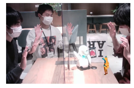
(b) AR operation