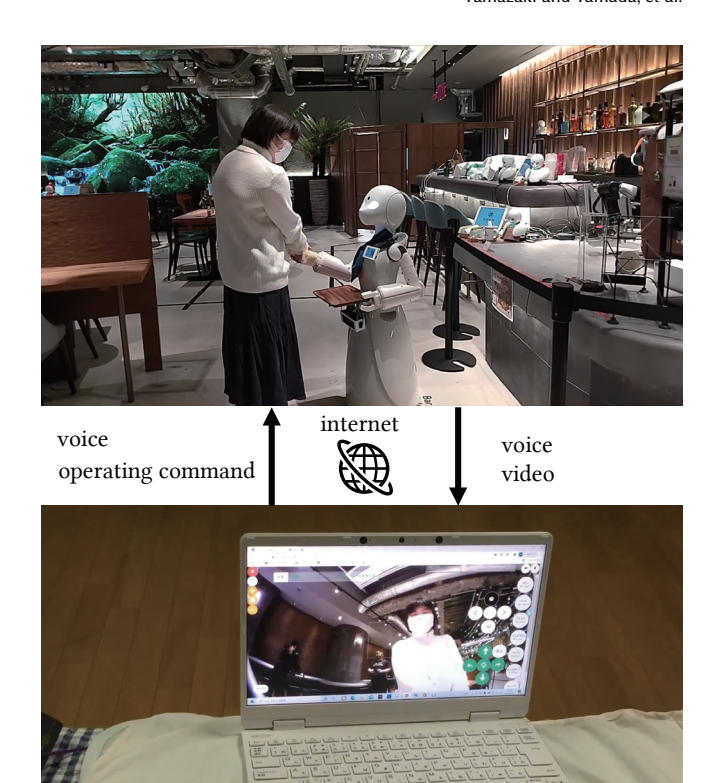
Figure 2: Operation of the avatar robot OriHime-D by a pilot with disabilities at the Avatar robot cafe.

In addition to the telepresence robot, the Meta Avatar robot cafe has a VR space that is connected to reality, and a social system of working at the cafe all in one set. That is why we were able to realize this kind of experience by people with disabilities. We believe this is the major value of the Meta Avatar robot cafe. We believe that if we can provide the technology to switch between various physical and virtual avatars with different characteristics