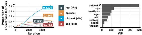
Fig. 1: Left: Model trace showing how and when the four most selected additive terms entered the model. Right: Variable importance (cf. Au et al, 2019 ) of selected features in decreasing order.

The estimated effect of the most important feature oldpeak (cf. Figure 1, Right) found is further visualized in Figure 2. Looking at the shared effect, we find a negative influence on the risk of heart disease when increasing ST depression ( oldpeak ). When accounting for site-specific deviations, the effect becomes more diverse, particularly for Hungary.