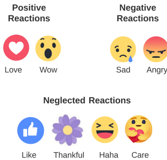
Figure 2: Reaction categorization for the annotation

A binary classification method which was introduced through the work of Senevirathne et al. (2020) and further improved for Facebook data by Weeraprameshwara et al. (2022) is used in this research as the annotation schema which is illustrated in the figure 2. Here, the Facebook reactions are divided into two classes; positive reactions and negative reactions. The reactions love and wow are considered as positive reactions while sad and angry are classified as negative reactions. The reactions like and thankful have been excluded as they are outliers in the data set with respect to the other reactions. The like is the de facto reaction given by the users and it does not yield a valid sentiment. The thankful reaction has appeared in a small time period making the presence insignificant compared to other reactions (only 0.00003% of the total reaction count). The haha reaction is also excluded due to the contradicting nature of its use cases (Jayawickrama et al., 2021). The care reaction is not included in this data set as it was first introduced to the platform in 2020 (Lyles, 2020), after the creation of the data set.