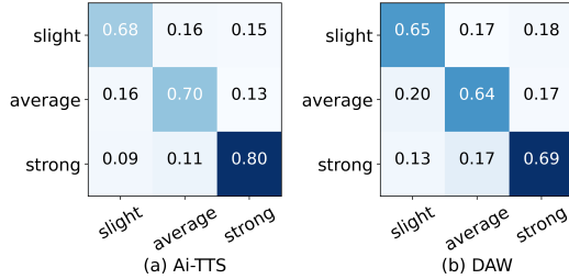
Fig. 2. Confusion matrices between perceived and intended accent intensity categories of synthesized speech. (a) Ai-TTS; (b) DAW. The X-axis and Y-axis of the figures represent the perceived and intended category, namely slight, average, and strong.

TDNN are [-1,0,1], [-1,0,1], [-3,0,3], [-3,0,3], [-3,0,3], [-6,-3,0] in order. We follow the Kaldi script 2 to train TDNN with 128 batch size. The word error rate of the TDNN acoustic model achieved 5.21 % for various test sets of LibriSpeech on average, which is encouraging. As mentioned before, with the help of accent renderer, our Ai-TTS can produce more expressive speech with L2 accent.