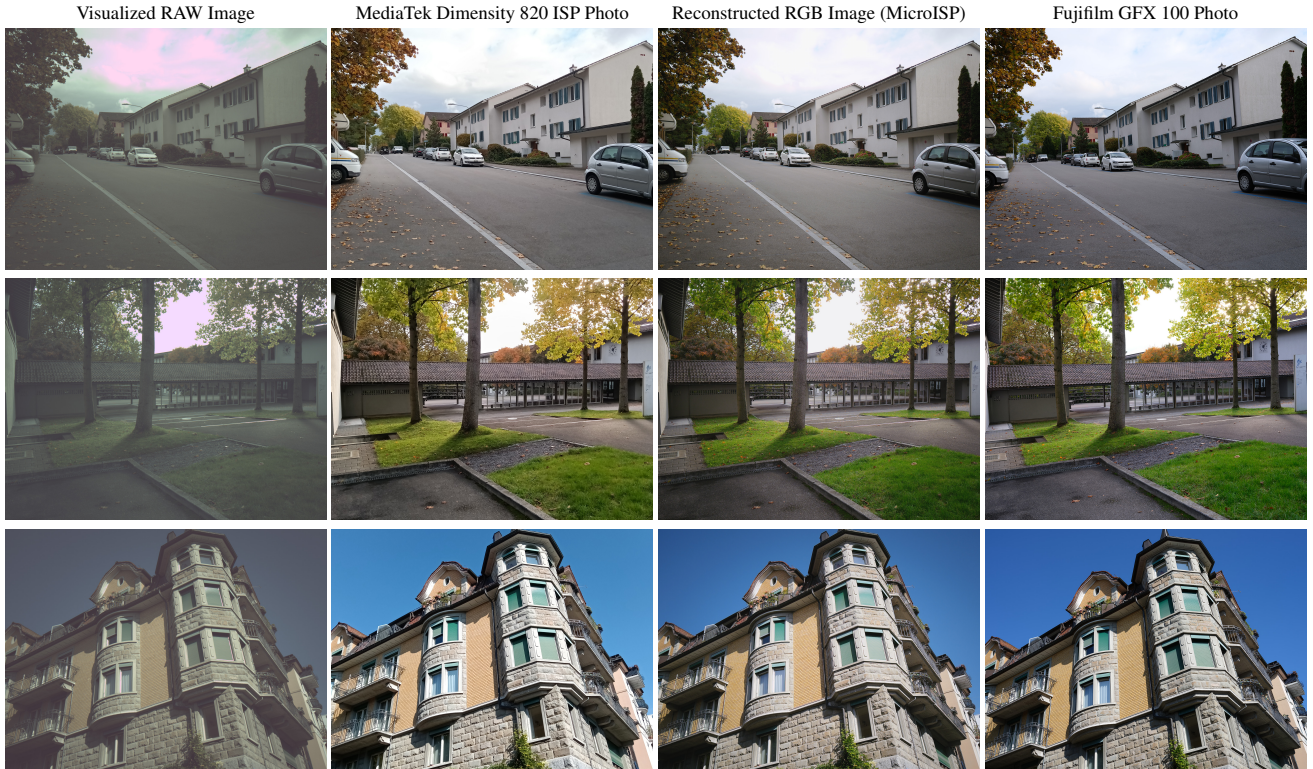
Figure 3. Sample visual results obtained with the proposed deep learning method. Best zoomed on screen.

form global image processing such as white balancing, gamma and color correction, we added an enhanced channel attention block with the structure of Fig. 2. While the standard attention units are using global average pooling followed by several conv layers, our initial experiments revealed that the performance of these blocks is not sufficient in our case as they are not taking into account any information about the image content that is removed after the pooling layer. Thus, we propose an enhanced structure: first, a 1 \times 1 convolution with stride 3 is applied to reduce the dimensionality of the feature maps. Next, three convolutional blocks with 3 \times 3 filters and stride 3 are applied to learn the global content-dependent features and reduce the resolution of the feature maps another 27 times. Finally, the average pooling op is used to get 1 \times 1 \times 4 features that are then passed to 2 additional conv layers generating the normalization coefficients. The proposed architecture is both performant and computationally efficient due to aggressive dimensionality reduction, leading to an execution time of the overall attention block appr. twice smaller than the runtime of one normal 3 \times 3 convolution.