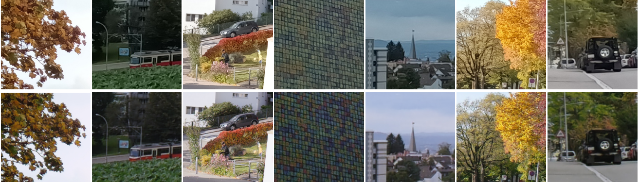
Figure 4. Sample crops from the MediaTek ISP photos (top) and the corresponding images processed with the MicroISP model (bottom).

with batch size 50. The network parameters were optimized for 500 epochs using the ADAM [30] algorithm with a learning rate of 2e^{-5} . Random flips and rotations were applied to augment the training data and prevent overfitting.