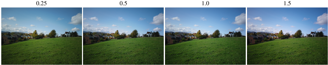
Figure 6. Sample visual results of the MicroISP models with different depth multipliers.

not be very critical e.g. , for real-time video processing). In this particular task, any further increase of model complexity is leading to only marginal performance improvements, thus using two building blocks delivers the best runtime-quality trade-off for the considered problem.