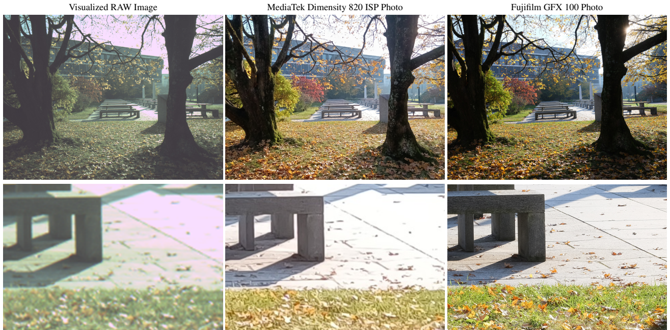
Figure 1. Example set of full-resolution images (top) and crops (bottom) from the collected Fujifilm UltraISP dataset. From left to right: original RAW visualized image, RGB image obtained with MediaTek’s built-in ISP system, and Fujifilm GFX100 target photo.

dataset using a professional medium format camera capturing 102MP photos and a Sony mobile sensor for getting the original RAW data, and align pixel-wise the obtained photos. Finally, we present experiments evaluating the quality of the resulting RGB images and the runtime of the solution on recent flagship mobile platforms and AI accelerators.