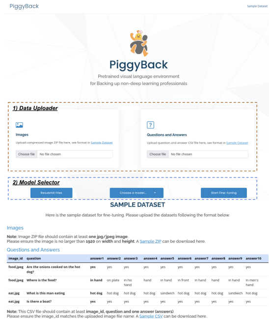
Figure 2: This figure shows the Preview of Data Uploader and Model Selector on the front-end interface in our PiggyBack.

those images or resubmit the image folder after modification; 3) if all the images meet the constraint, a green Success banner will show up, and the users can choose to fine-tune with current images or resubmit the image folder. The input question-and-answer data in CSV is preprocessed in the system backend.