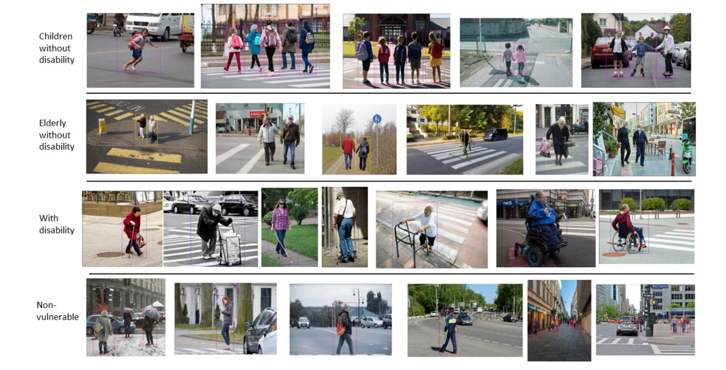
Fig. 1: Simple traffic scenes in our BGVP dataset