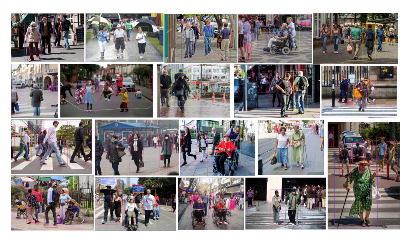
Fig. 2: Complicated traffic scenes in our BGVP dataset