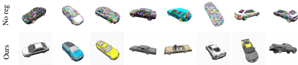
Figure 2: Unconditional generation results. The top row shows samples of diffusion model trained with ReLU-fields without regularization. The bottom row shows samples of diffusion model trained with regularized ReLU-fields. Our model is able to produce more diverse shapes and correct colors.