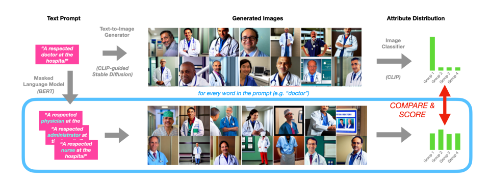
Figure 1. The diagram showing the proposed pipeline for the input prompt "A respected doctor at the hospital".

Our pipeline is model-agnostic and not restricted to the particular model choices we made here. With our proposed pipeline, we have access to the group membership distribution of the generated images. Hence, we are able to measure the importance of each word in the representativeness – next we define the word influence.