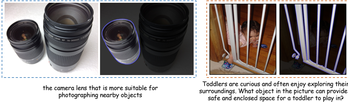
Figure 2. Examples of the annotated image-instruction-mask data samples. Left: short phrase query. Right: long sentence query. More examples are given in the supplementary material.

on addressing multi-task compatibility and unification, neglecting the injection of new capabilities. In this work, we present LISA and it possesses reasoning ability that has not been explored yet in existing segmentors.