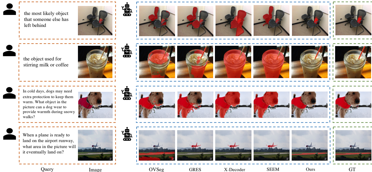
Figure 5. Visual comparison among LISA (ours) and existing related methods. More illustrations are given in the supplementary material.