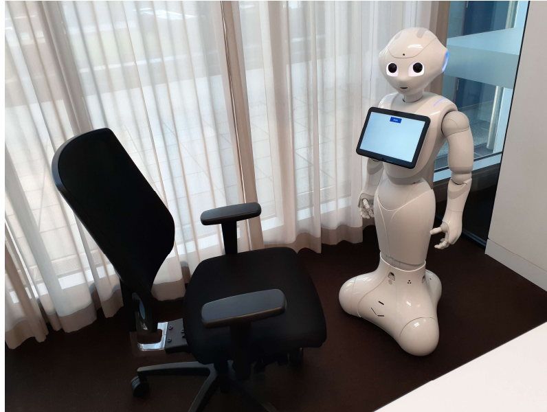
Figure 1: Experimental Setup

such as reported technical faults. A photograph of the experimental set-up can be seen in Figure 1.