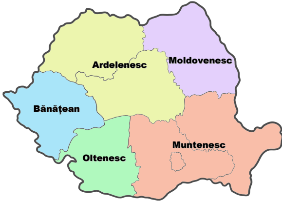
Figure 1: The administrative regions of Romania and the dominant dialect spoken within each region. RoDia is the first benchmark to contain samples representing these five Romanian dialects.

2020; Dogan-Schönberger et al., 2021; Plüss et al., 2023) offer a more holistic representation, capturing not only the lexical disparities, but also the subtle intonations and accents inherent in speech.