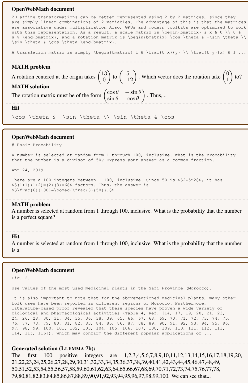
Figure 6: Data overlap: Example false positives using 10-gram match between MATH solutions and OpenWebMath documents ( top ), 20-gram match between MATH problems and OpenWebMath documents ( middle ), and 30-gram match between LLEMMA-7b’s generated solutions and OpenWebMath documents ( bottom ).