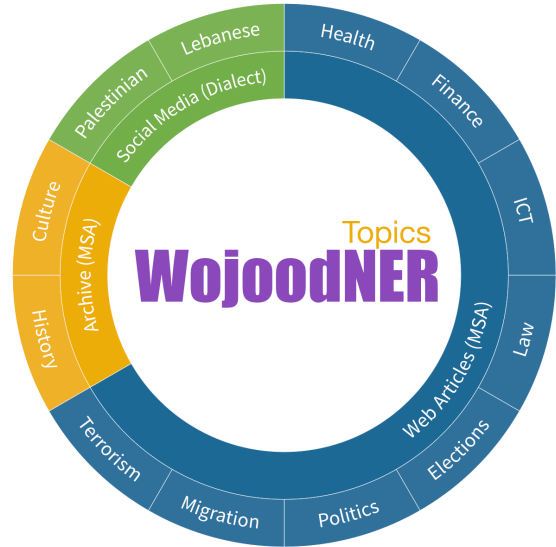
Figure 1: Topics in the Wojood NER corpus.

NER is a fundamental task in Natural Language Processing (NLP), especially in information extraction and language understanding (Jarrar et al., 2023a). The objective of NER is to identify and classify named entities in a given text into pre-defined categories, such as “person”, “location”, “organization”, “event”, and “occupation”. NER is also a critical task for many NLP applications, such as question-answering systems (Shaheen and Ezzeldin, 2014), knowledge graphs (James, 1991), and semantic search (Guha et al., 2003), interoperability (Jarrar et al., 2011) among others. Named entities can either be flat or nested. For instance, in the sentence “Cairo Bank announces its profit in 2023”, there are two flat entities: “Cairo Bank” is tagged as ORG (i.e., organization) and “2023” as DATE . In nested NER, entity mentions contained inside other entity mentions are also considered named entities. In this case, “Cairo”, is tagged as GPE (i.e., geopolitical entity). Section 3 illustrates more examples. As will be discussed in Section 2, research in Arabic NER is currently limited, particularly in the context of nested entities. This limitation is not exclusive to Modern Standard Arabic (MSA) but extends to various Arabic