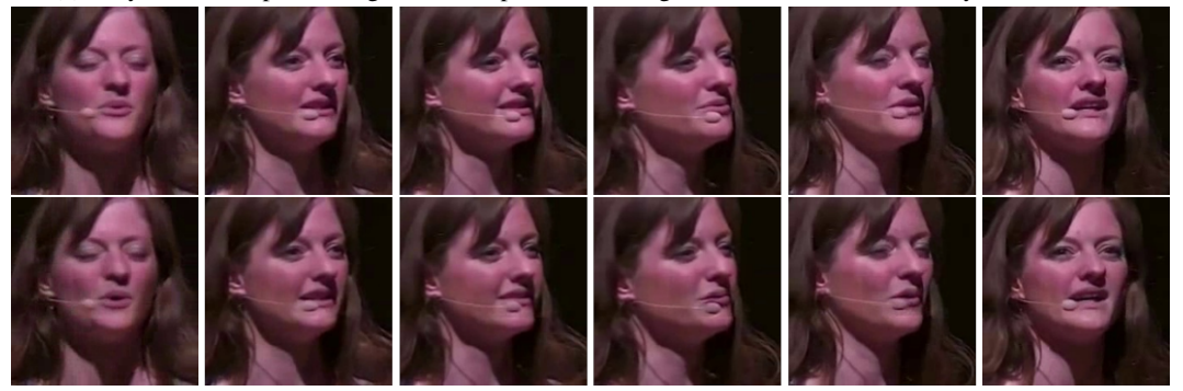
(b) Resynthesis sample for French. The top row is the original, the bottom row is the synthesized one.

Figure 3: Quantitative comparison of audio and visual speech resynthesized from discrete units on English and French. More experimental results are available on the demo page.