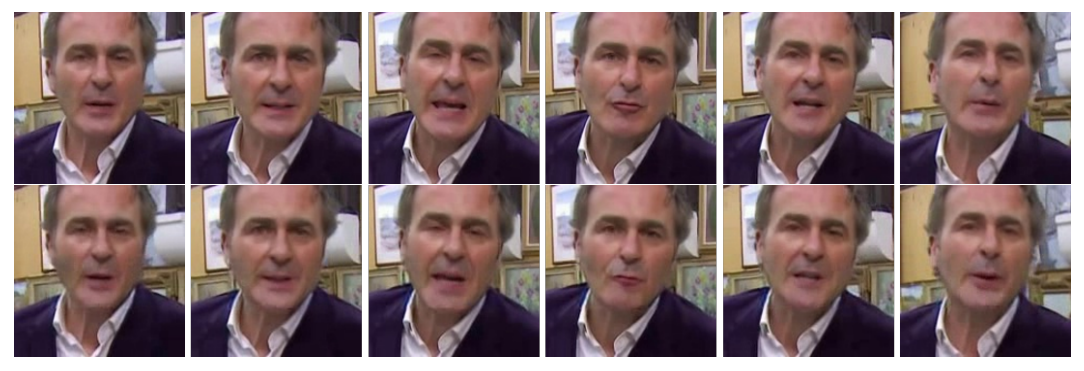
(a) Resynthesis sample for English. The top row is the original, the bottom row is the synthesized one.

We present samples of our unit-based talking head generation method (Unit2Lip). For each discrete unit, we equidistantly selected 6 pairs of corresponding original and generated Talking Head video frames. Notably, the lip shapes between each pair of images are highly consistent, suggesting that the model is adept at reconstructing the lip shapes associated with discrete units while preserving more of the original video information. Furthermore, we conduct experiments in French and the lip shape consistency is also well-maintained, demonstrating that the Unit2Lip can be generalized across languages, not only to English but also to different languages.