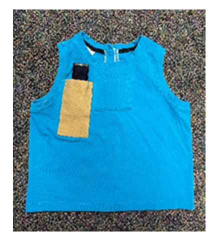
Fig. 2. Child vest with Sony recorder (1.43"*4.31"*6.13") in the front pocket.

In our framework, the results generated by ALICE, Whisper, and the expert include timestamps and must be synchronized and aligned. The framework entails three types of synchronization: Human vs. Whisper, Whisper + ALICE, and Human vs. Whisper + ALICE. Given the importance of Whisper's transcription results and its relatively lower timestamp precision (to the tenth of a second), alignment is based on Whisper's transcriptions for both human expert and ALICE results. If a segment is detected by the human expert or ALICE but not by Whisper, it is added to the final alignment with a blank transcription assignment. Conversely, if Whisper identifies a single segment that corresponds to multiple segments in human expert and ALICE results, these multiple transcriptions are merged, selecting the speaker class that occupies the longest duration. The final aligned results are used for reliability analyses.