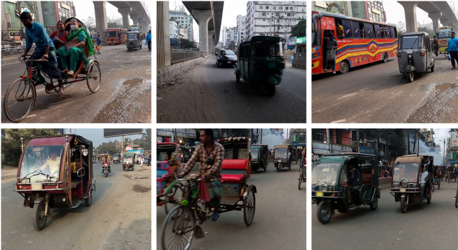
Fig. 2. Extracted image dataset