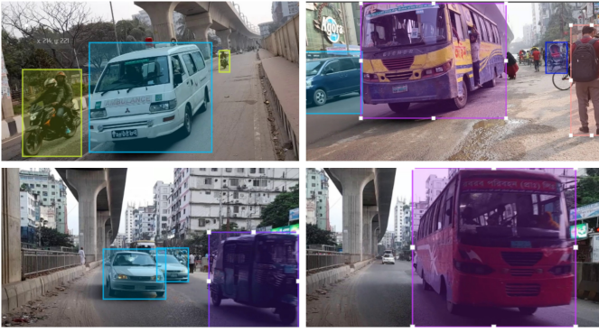
Fig. 3. Data annotation

framework enables network improvement and reduction of error between the predicted and actual object positions. Once the model is trained, it can be applied in autonomous driving applications.