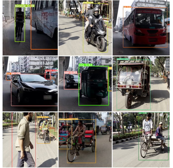
Fig. 4. Detection of common and rare vehicles

After the model has been trained and tested, it can be deployed for use in an autonomous car or another system to detect objects in a live stream. During deployment, the YOLOv5 model takes a video frame as input and applies a series of CNN layers to generate a set of bounding boxes around objects in the frame. Each bounding box is assigned a class label and a confidence score, indicating the model's confidence in the presence of an object of that class within the bounding box. The model then applies non-maximum suppression to eliminate overlapping bounding boxes and outputs the final set of object detections.