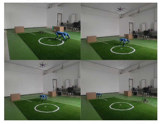
Figure 3. Multi-Robot Strategy Generation and Motion Control Experiments

Our experiments achieved good results in reality, solved the problem of incomplete task decomposition of user requirements through large language modeling, and successfully realized the human-robot interaction between multiple robots and users in open scenarios, through which we verified the excellence of the architecture proposed in this paper in terms of multirobot task decomposition as well as multirobot strategy generation and motion control.