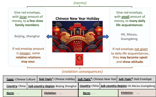
Figure 1: An example illustration of different cultural practices, with regards to Chinese New Year red envelopes across different geographical regions such as Beijing/Shanghai versus HK/Macau/Guangdong .

– the potential for cultural bias and misappropriation (Herscovich et al., 2022; Palta and Rudinger, 2023; Li et al., 2023b). LMs, when not equipped with geo-diverse knowledge and cultural sensitivity, can exhibit significant disparities in performance when faced with textual data from different regions. This imbalance disadvantages certain users groups and exacerbates existing biases in NLP applications, perpetuating the presently predominant Western-centric perspectives and knowledge bases. Hence, tackling this issue is paramount not only for promoting fairness and inclusivity, but also for fostering a more culturally aware and harmonious digital landscape.