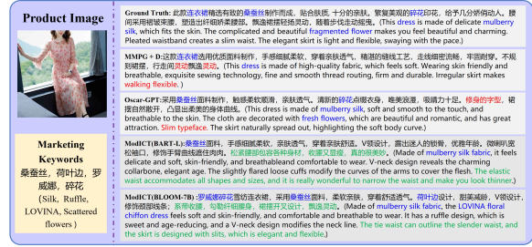
Figure 3: An illustration of descriptions generated by several models. The blue words represent keyphrases related to marketing keywords. Words in red show the inaccurate expression. The green-colored sentences are the eye-catching statements.

els based on LLMs. Increasing LLM parameters results in a wider range of outcomes, yielding high diversity but lower accuracy. It may be attributed to the fact that the generation of larger language models is more diverse and less controllable.