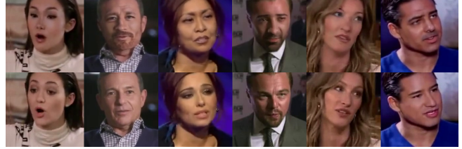
Fig. 1. Sample outputs of RID-Twin: The images from source videos ( bottom ) and their corresponding generated D-Twins ( top )

In this digital era, the preservation of identity is a crucial aspect of all publicly available content, especially in domains such as healthcare, video surveillance, social media, and biometrics. While the availability of human video datasets serves as a useful resource for several automation-related tasks such as activity recognition, human behavioral pattern recognition, and clinical analysis, it becomes a challenge to ensure that the identities of the subjects are not revealed [1]. There are various approaches to creating de-identified faces that are realistic in terms of human likeness and visual fidelity, and compatible with different tasks and scenarios. The earliest approaches relied on basic image-based editing methods such as pixelating or blurring [2, 3]. With the help of generative vision models, it is possible to generate photo-realistic synthetic images. Deep learning based generative models such as Encoder-Decoder