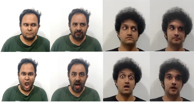
Fig. 4. RID-Twin on proposed custom dataset. In this figure, we see two examples of facial expression variation, the top row showing an instance of looking left, and the bottom row showing an instance of the expression 'shocked'. From left, we have frames from the first user's source video, the corresponding de-identified video, the second user's source video, and the corresponding de-identified video.

tive pipeline for automatic face de-identification for videos.