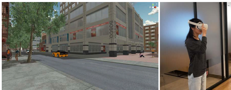
Fig. 4. The simulated environment used in the AV study (left) and a participant tapping on the headset to send a crossing request (right).

Data Collection. In addition to questionnaire data, we obtained qualitative data relevant to the research questions addressed in this paper using post-study semi-structured interviews. Participants were inquired about (1) the overall experience, (2) their preferred conditions and (3) their opinions about aspects such as interaction, information display and simulated environment.