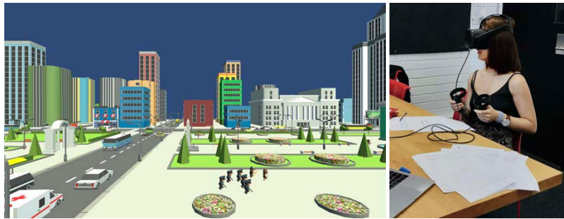
Fig. 2. The simulated environment of the navigation study (left) and a participant using controllers for movement and interactions (right).

Data Collection. Along with questionnaire data and HMD-logged data such as task completion times, we collected qualitative data using the post-trial general feedback form (probing favourable aspects and areas for improvement) and post-study semi-structured interviews. The interview aimed to learn about (1) participants' overall experience, (2) their preferred conditions and (3) their opinions about different aspects of the prototype, such as interaction and information display. Participants were also asked about their VR experience and whether they suffered from motion sickness.