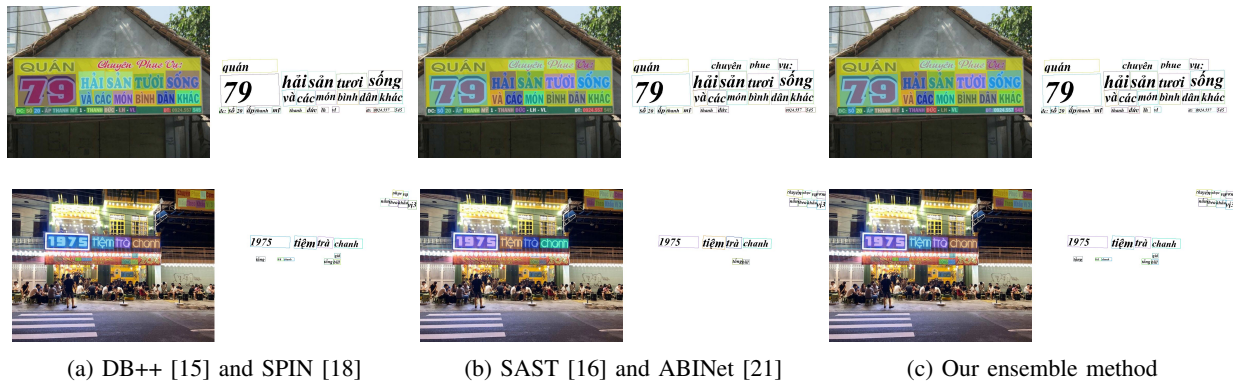
Fig. 3: Visualization of results of our ensemble learning framework.