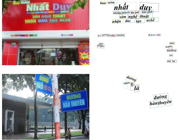
Fig. 1: Scene text spotting in Vietnamese urban environments poses various challenges, such as obscured by trees and perspective-shifted.

In addition, the realm of scene text spotting in Vietnamese urban environments is rife with challenges for