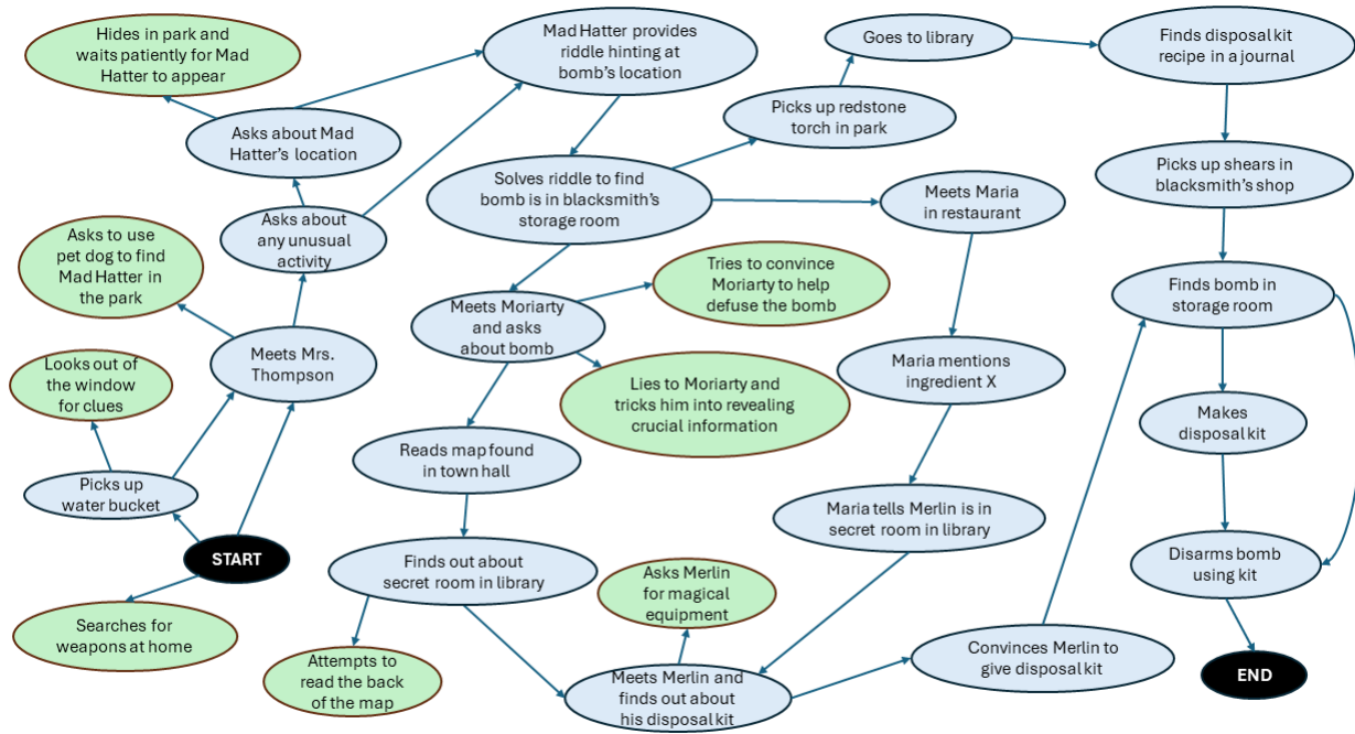
Fig. 3. The blue nodes make up the initial narrative graph intended by the designers. A single path from the start node to the end node indicates one possible way to stop the explosion. The green nodes are a few examples of the emergent nodes created by players implicitly through their gameplay.