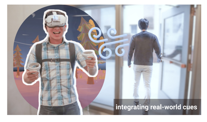
Figure 1: A demonstration of repurposing real-world sensory cues for MR. The wind gust from the real world, instead of distracting the user, is mapped with the sway of trees in MR. Figure adapted from Tao and Lopes [15].

Sean Follmer sfollmer@stanford.edu Stanford University Stanford, CA, USA