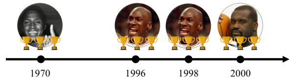
Figure 3: Player awards are presented in a timeline.

Text: Shaquille O'Neal is one of only three players to win NBA MVP, All-Star