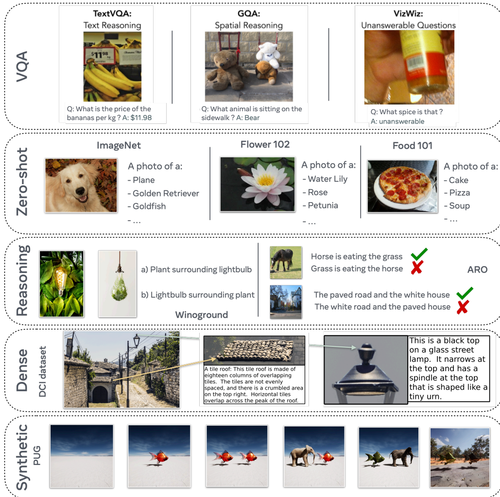
Figure 3: Different methods to evaluate VLMs. Visual Question Answering (VQA) has been one of the most common methods, though the model and ground truth answers are compared via exact string matching, which may underestimate the model performance. Reasoning consists of giving VLMs a list of captions and making it select the most probable one within this list. Two popular benchmarks in this category are Winoground [Diwan et al., 2022] and ARO [Yuksekgonul et al., 2023]. More recently, Dense human annotations can be used to evaluate how well the model is able to map the captions to the correct parts of an image [Urbanek et al., 2023]. Lastly, one can use synthetic data like PUG [Bordes et al., 2023] to generate images in different configurations to evaluate VLM robustness to specific variations.